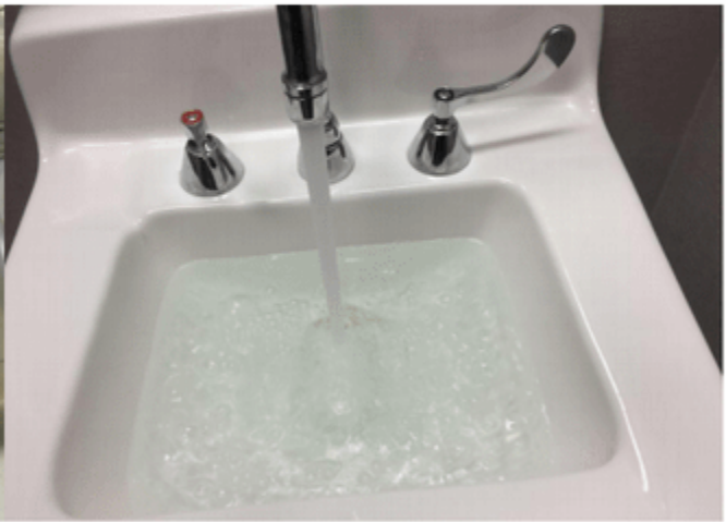
2016: Detroit Water with Enhanced Corrosion Control