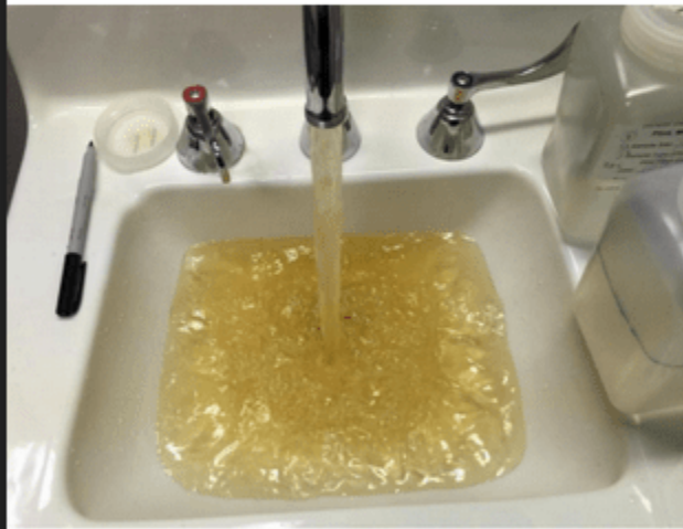
2015: Flint River without Corrosion Control